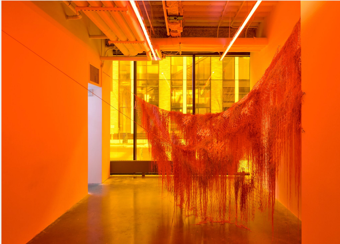
Installation View, Textures of Feminist Perseverance , 1 March - 27 April 2024.