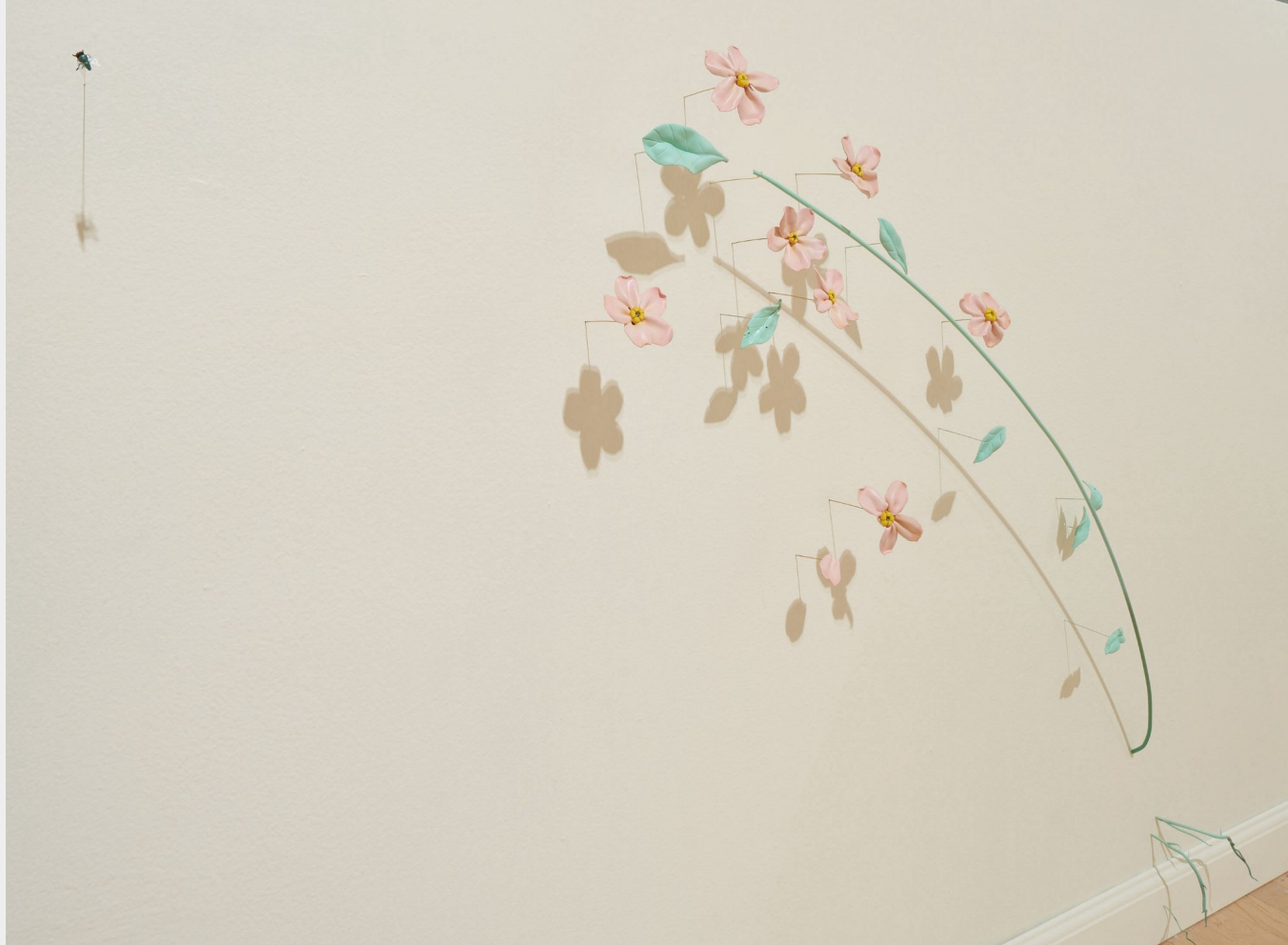
Detail of Langdon Graves