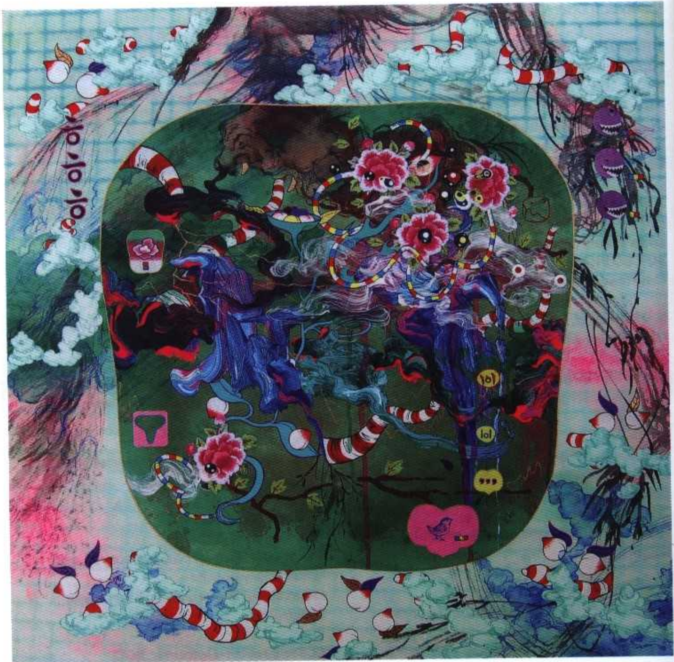
Land of HaHaHa, 2010