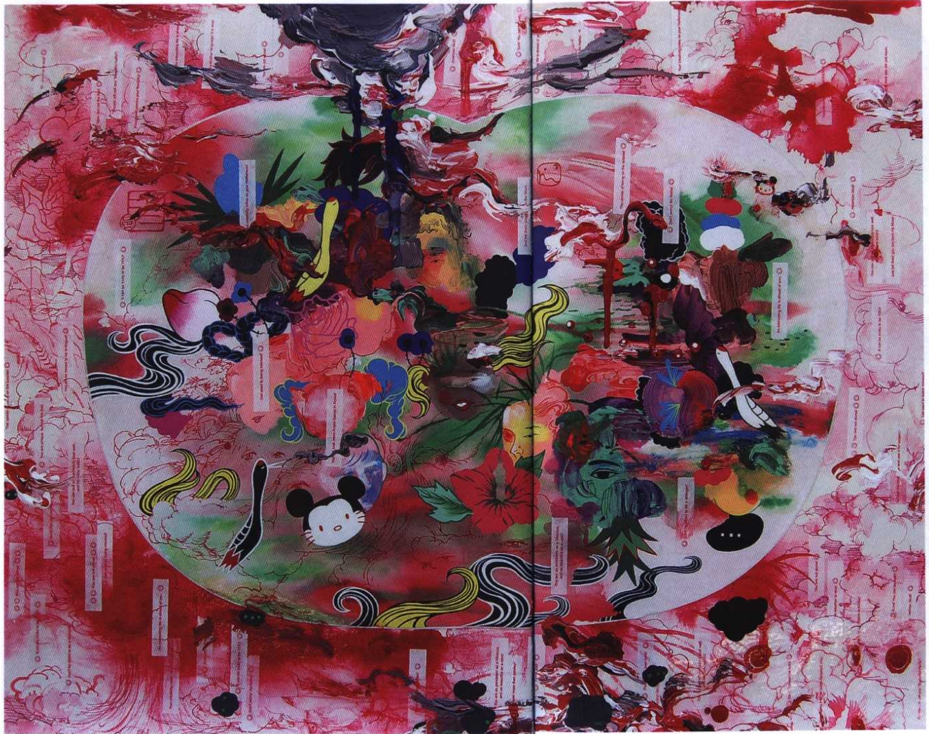
American Halfies, 2010