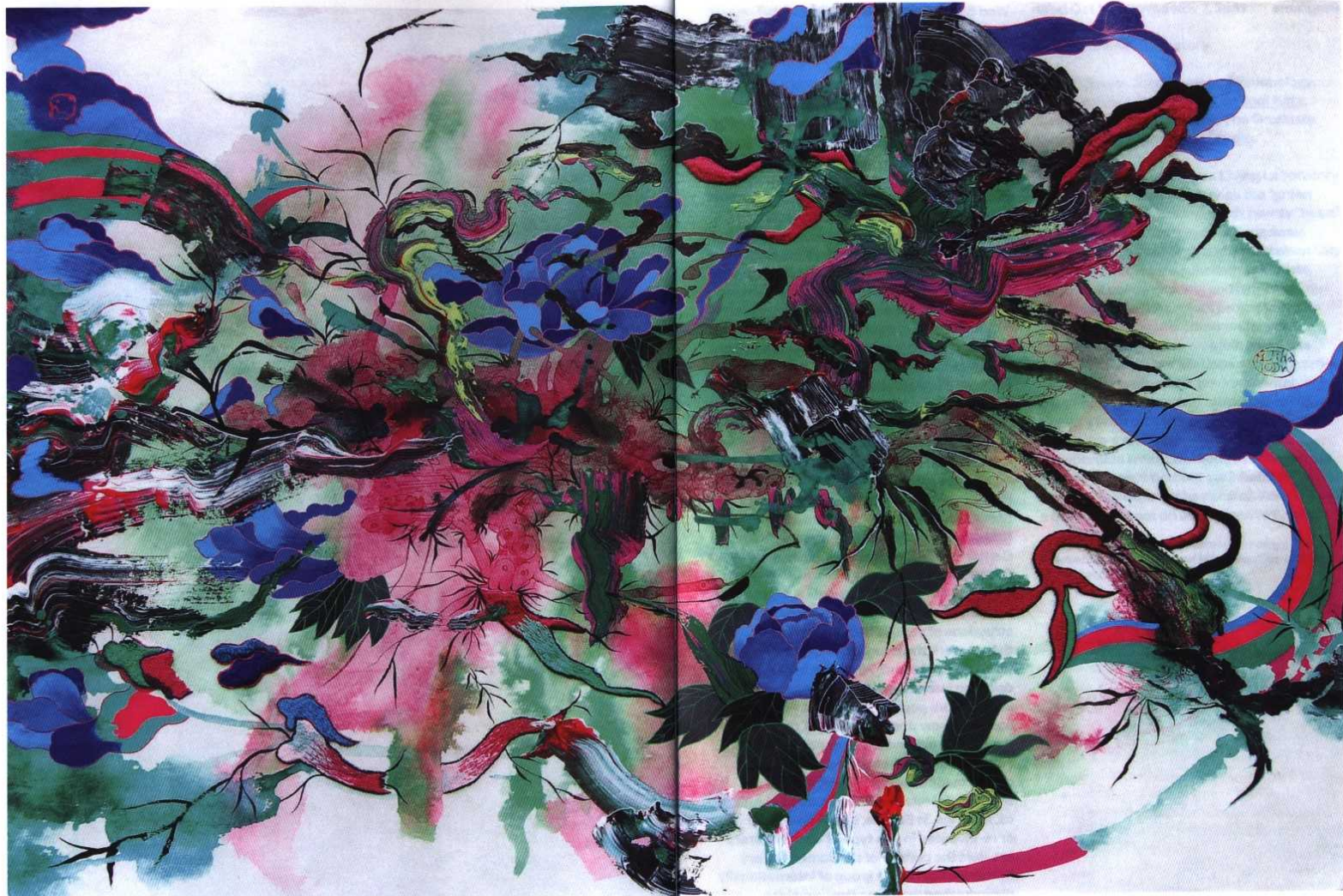
Uncanny Peony, 2009