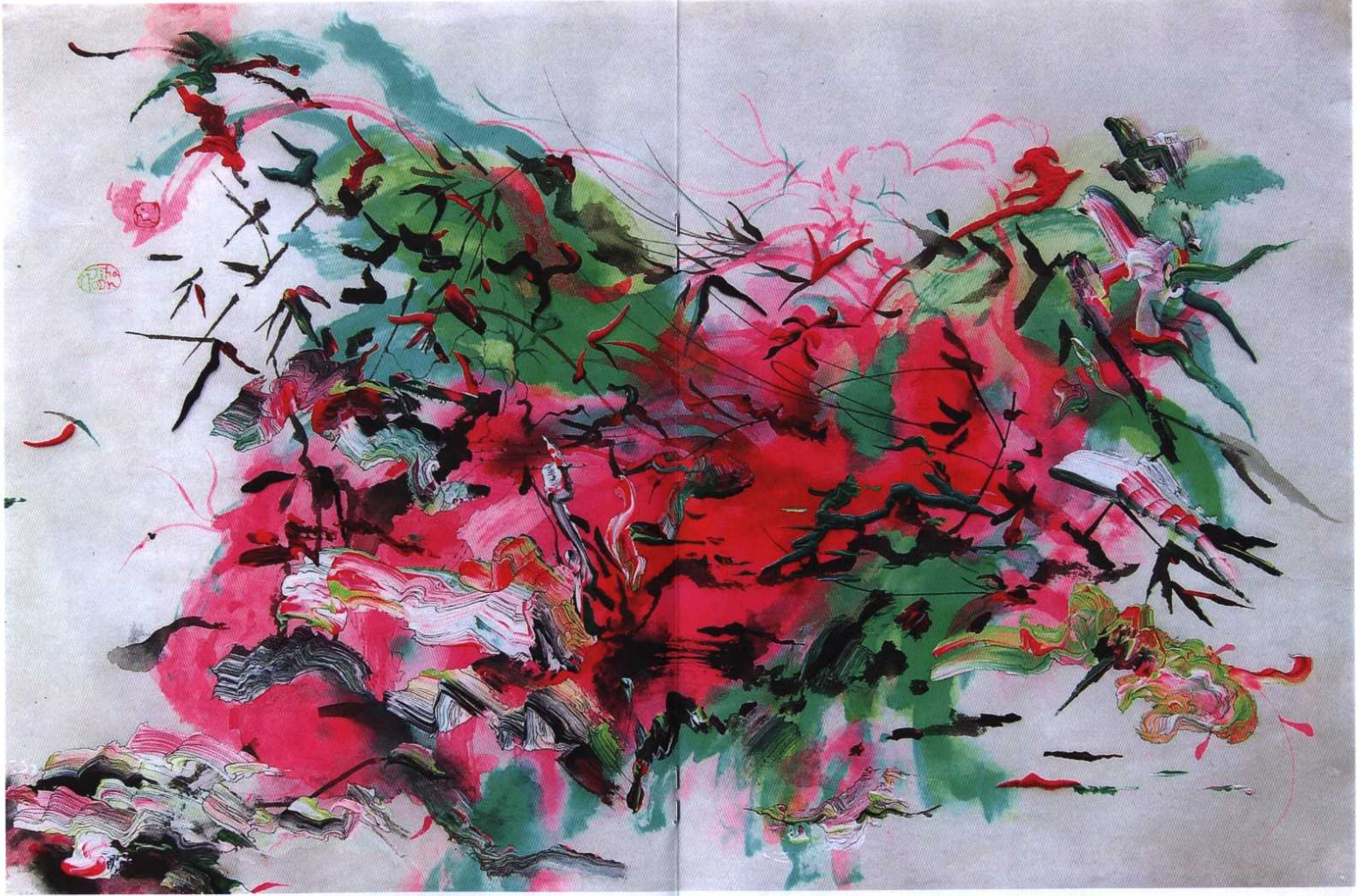
All Around, 2009