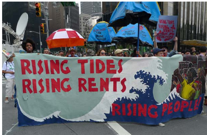
Right to the City Alliance contingent, People's Climate March, New York City, September 21, 2014