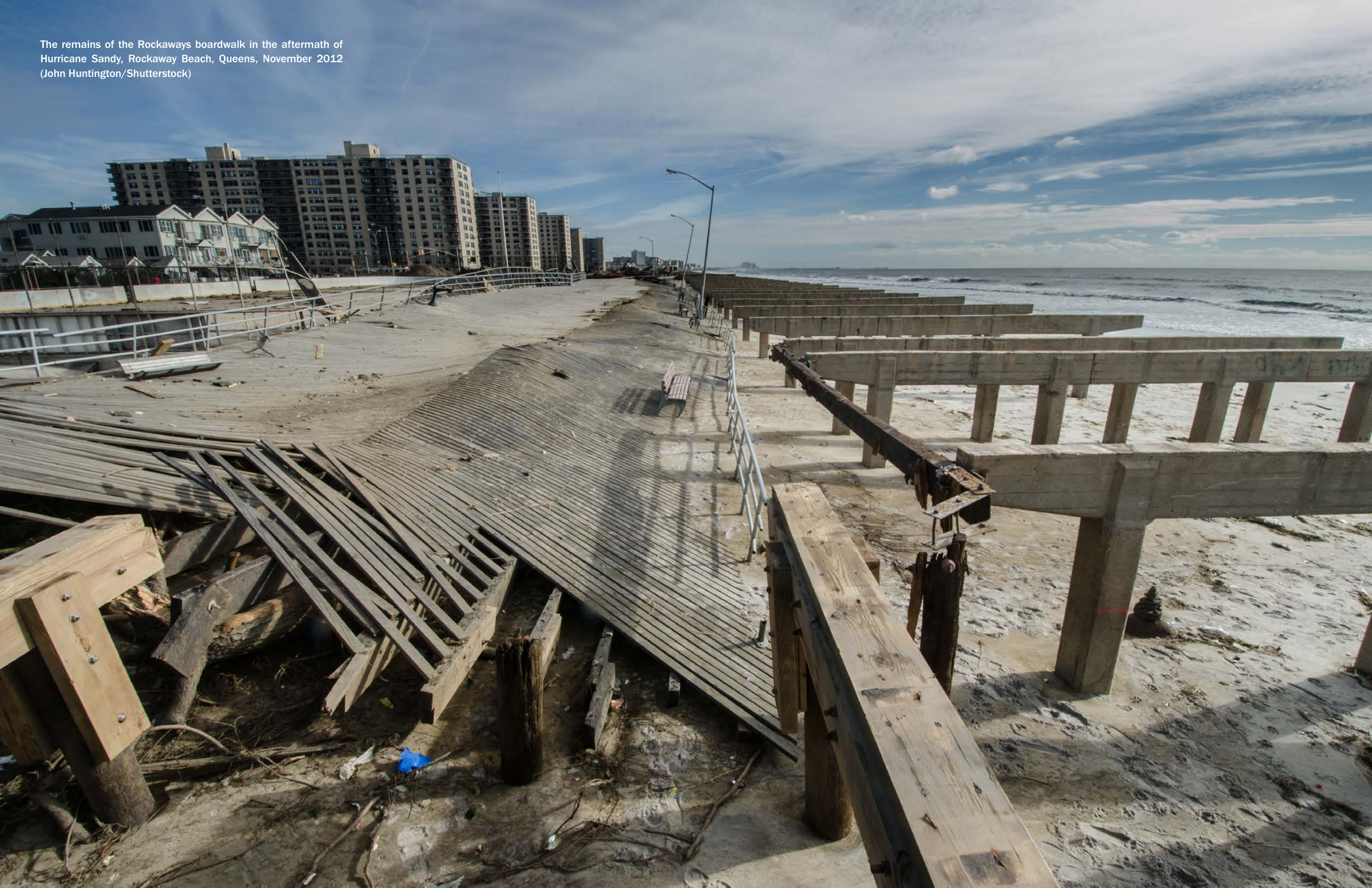
The remains of the Rockaways boardwalk in the aftermath of Hurricane Sandy, Rockaway Beach, Queens, November 2012