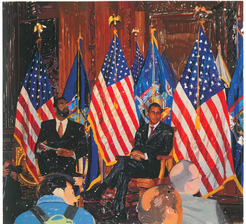
Peter Krashes, Governor and Flags , 2014, gouache on paper, 56.5 x 63 inches.