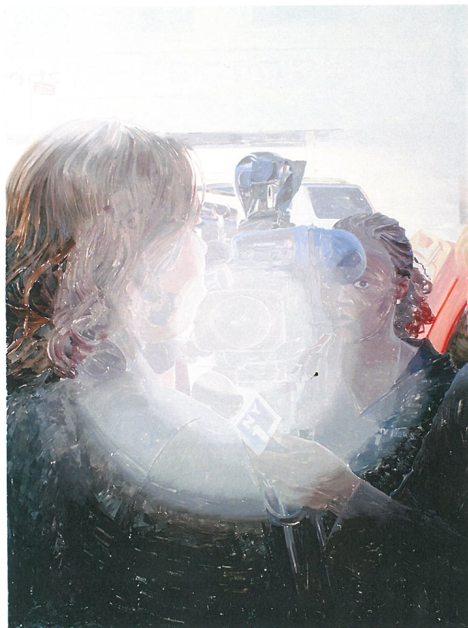
Peter Krashes, Cameras Always Find the Elected Official , 2010, oil on linen, 63 x 84 inches.