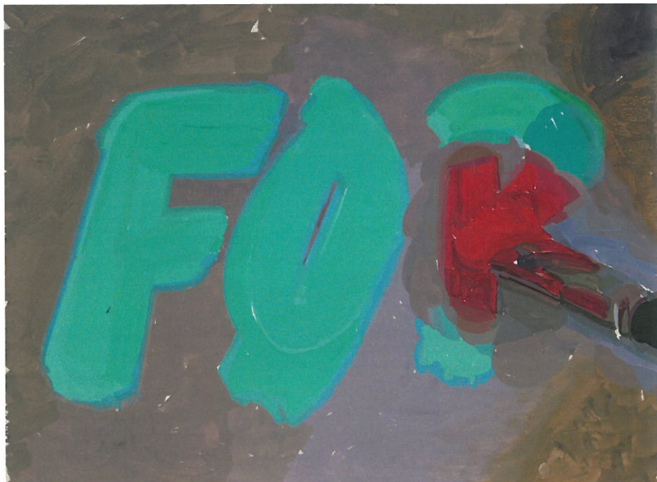
Peter Krashes, FOR! (Hand-painted Signs are More Effective) , 2009, gouache on paper, 18 x 24 inches.