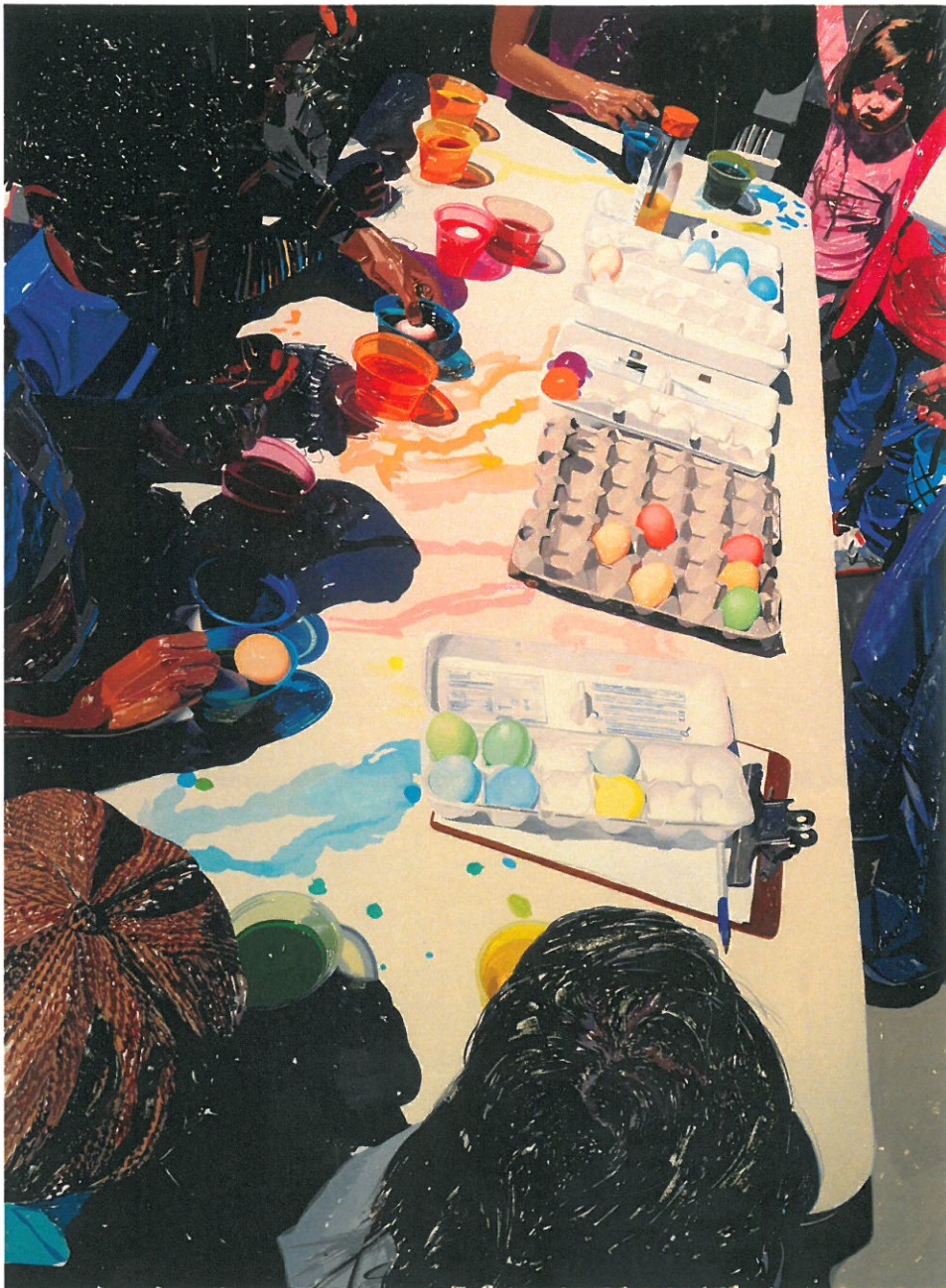
Peter Krashes, Egg Painting , 2015, gouache on paper, 65 x 48 inches.

Before it was displaced by Atlantic Yards / Pacific Park, there was a homeless shelter for families on Dean Street. It wasn't uncommon for the younger kids from the shelter to quiver as their faces were being painted during our block parties. It's hard to know why, but maybe it was an unfamiliar level of intimacy—whether of race, class, or gender.