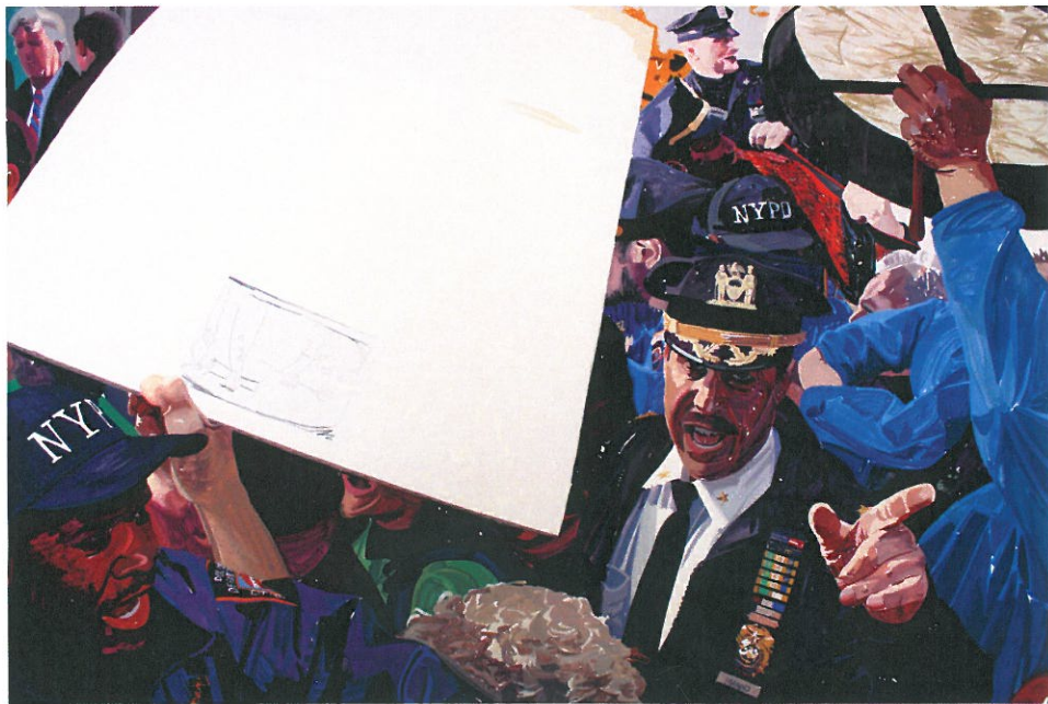
Peter Krashes, Making Noise to Be Heard , 2017, gouache on paper, 26.5 x 40 inches.