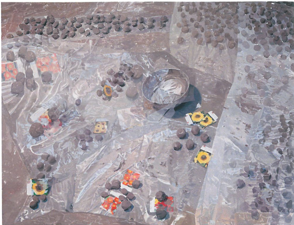
Peter Krashes, Seed Bomb Factory , 2011, Oil on linen, 63 x 84 inches.