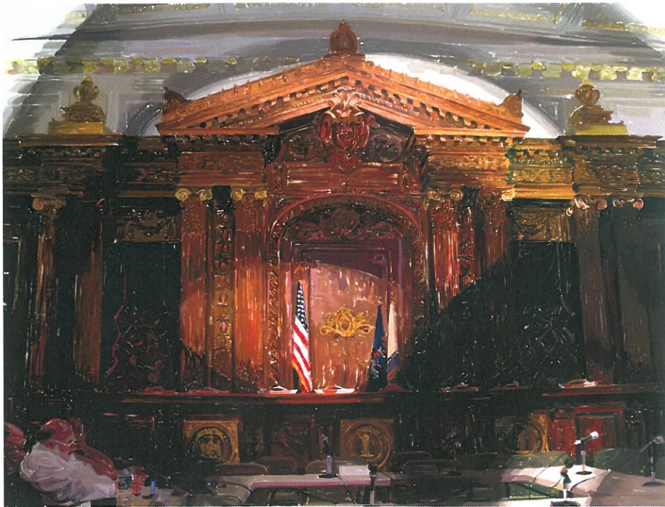
Peter Krashes, Empty Mics , 2008, oil on linen, 63 x 84 inches.